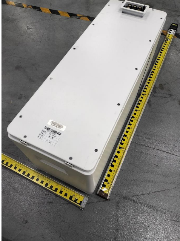
电池/ Battery(AI-W5.1-B 51.2V 100Ah 5.12kWh)